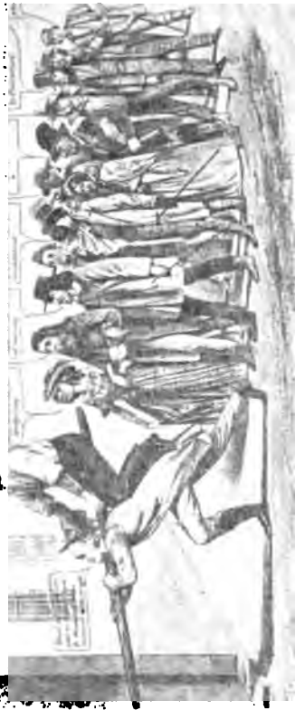
THE REPUBLICAN PARTY GOING TO THE RIGHT HOUSE.